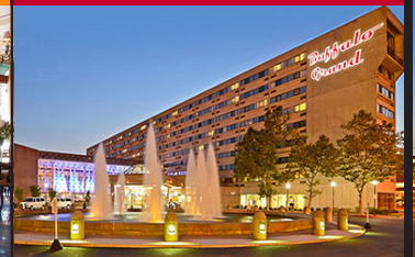
Buffalo Grand Hotel BUFFALO buffalogrand.com