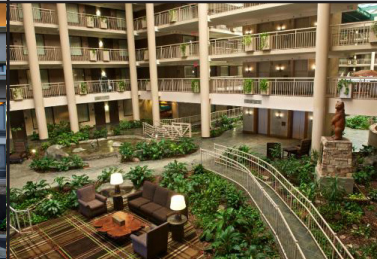
Embassy Suites East Syracuse SYRACUSE embassysuites.com