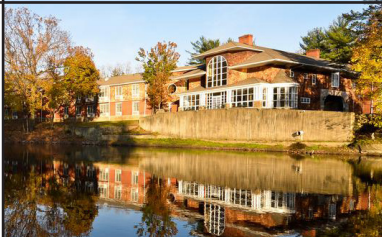
Best Western Plus The Inn & Suites at the Falls POUGHKEEPSIE bestwestern.com

New World Travel The America Specialists