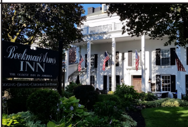
Beekman Arms Delamater Inn RHINEBECK beekmandelamaterinn.com

TourMappers North American Tour Specialists