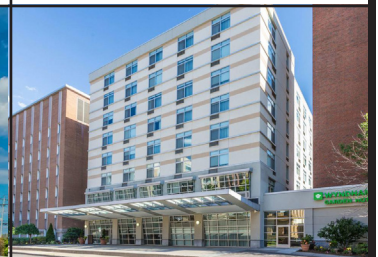
Wyndham Garden Inn Buffalo Downtown BUFFALO wyndhamhotels.com

These are suggested itineraries. Length of stay is customizable per individual request.