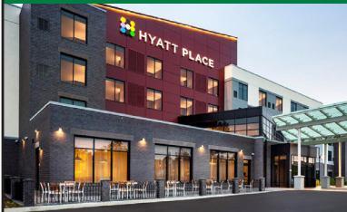
Hyatt Place POUGHKEEPSIE hyattplacepoughkeepsie.com