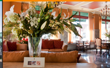
Jefferson Clinton Hotel SYRACUSE jeffersonclintonhotel.com