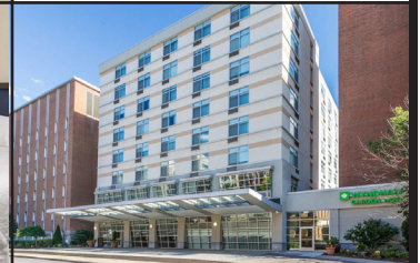
Wyndham Garden Inn Buffalo Downtown BUFFALO wyndhamhotels.com

TourMappers North American Tour Specialists