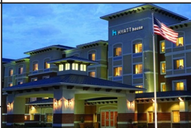
Hyatt house Fishkill FISHKILL fishkill.house.hyatt.com