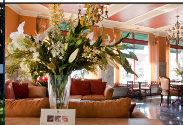
Jefferson Clinton Hotel SYRACUSE jeffersonclintonhotel.com