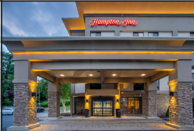
Hampton Inn Fishkill FISHKILL hilton.com/en/hotels/fhknhyx-hampton-fishkill/