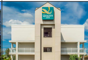
Quality Inn Carrier Circle SYRACUSE qualityinn.com