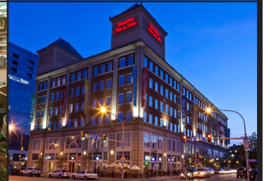
Hampton Inn & Suites Downtown Buffalo BUFFALO hamptoninn.com

New World Travel The America Specialists