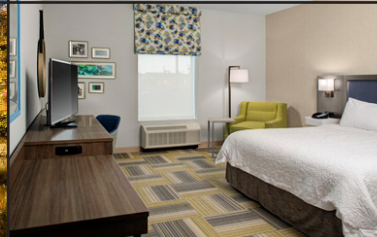
Hampton Inn Syracuse North SYRACUSE hamptoninn3.hilton.com